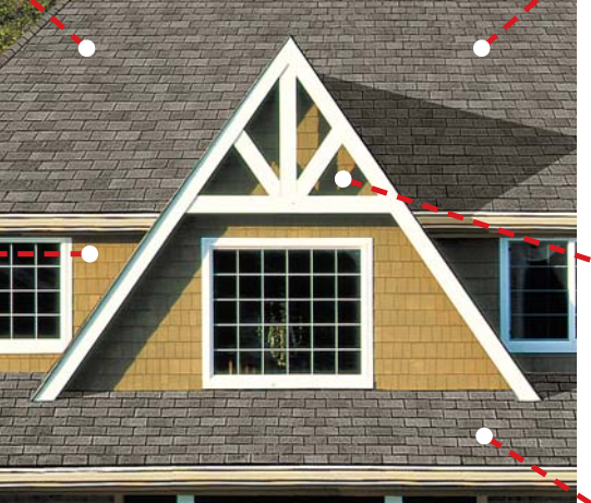
Leakage in attic after