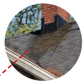
Dark, "dirty-looking" areas on your roof Possible causes: Loss of granules due to age of shingles or blue-green algae stains