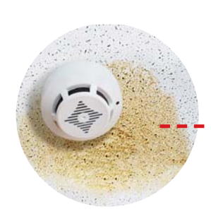
Stains on interior ceilings and walls or mold and mildew growth Possible causes: Inadequate or faulty shingle underlayment allowing leakage; inadequate ventilation