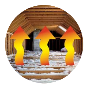
Excessive energy costs Possible cause: Insufficient attic ventilation causes heating/cooling system to run excessively