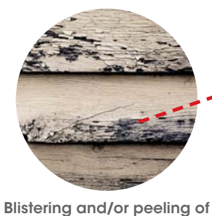
outside paint Possible cause: Excessive moisture or high humidity due to poor attic ventilation